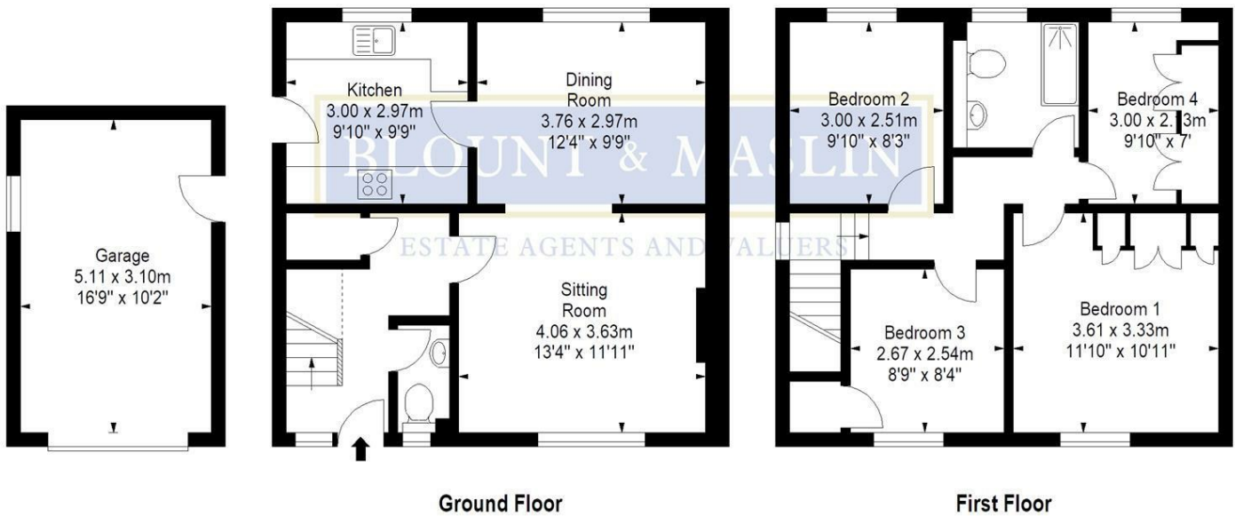
Illustration For Identification Purposes Only. Not To Scale

* As Defined by RICS - Code of Measuring Practice